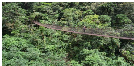
Over the treetops of Boquete

PLEASE DO NOT MAKE FLIGHT ARRANGEMENTS OR PURCHASES UNTIL THE ETV ENDOWMENT OFFICE NOTIFIES YOU TO DO SO.